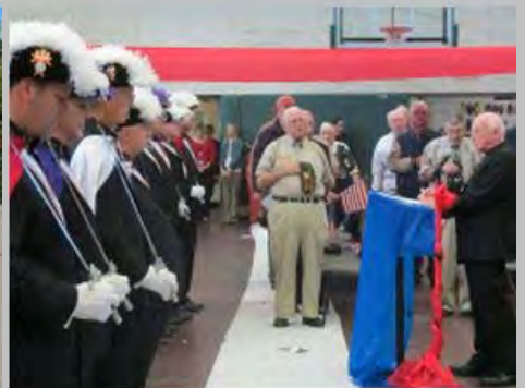
Veterans Day Parade