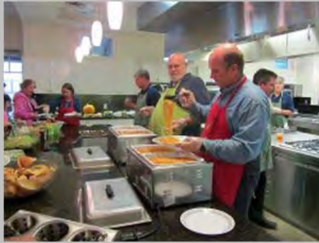
Ronald McDonald House Lunch