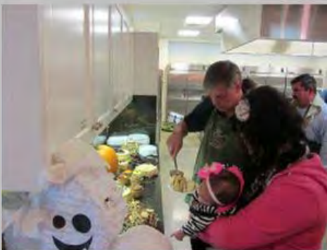
Ronald McDonald House Lunch