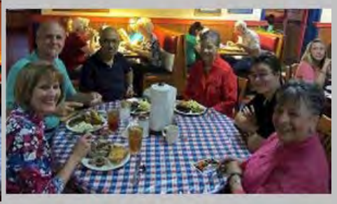
Fundraiser at Spring Creek Barbeque Fundraiser at Spring Creek Barbeque Fundraiser at Spring Creek Barbeque