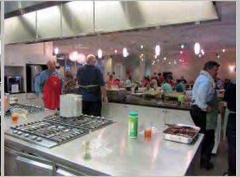
Ronald McDonald House Lunch