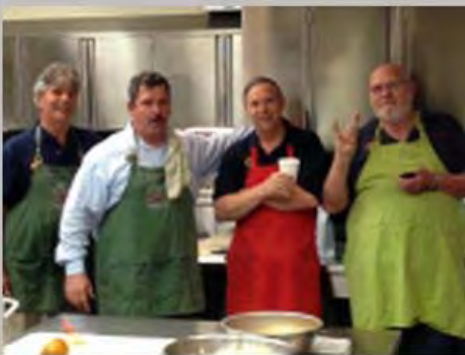
Ronald McDonald House Lunch