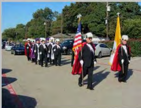
Veterans Day Parade