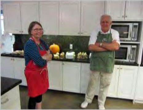
Ronald McDonald House Lunch