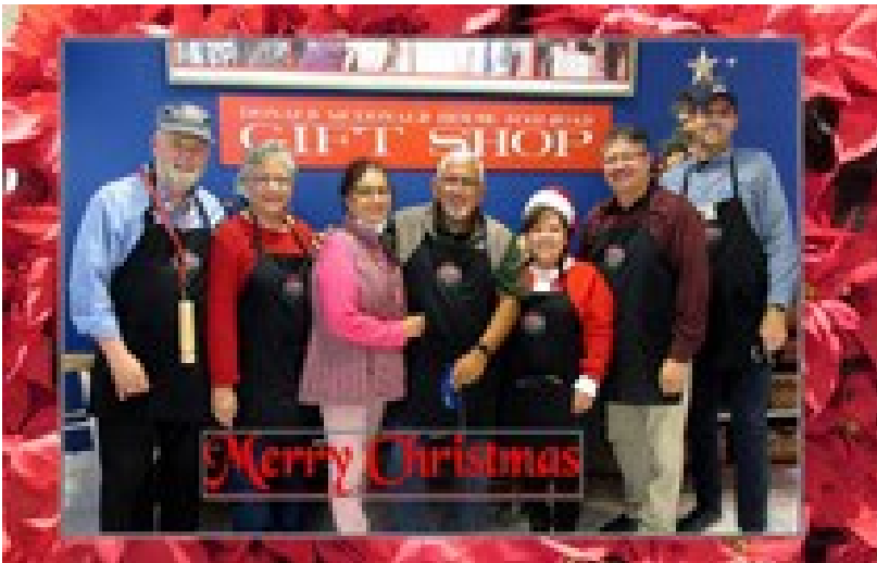
The Trains at North Park Volunteers