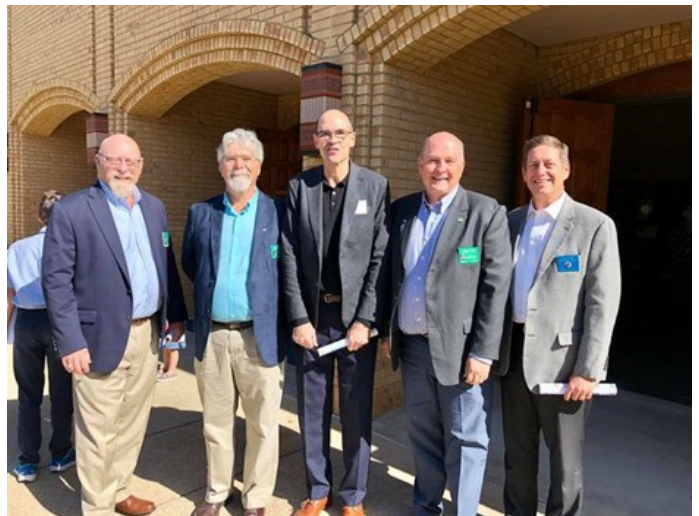
Five Past Grand Knights after the Memorial Mass