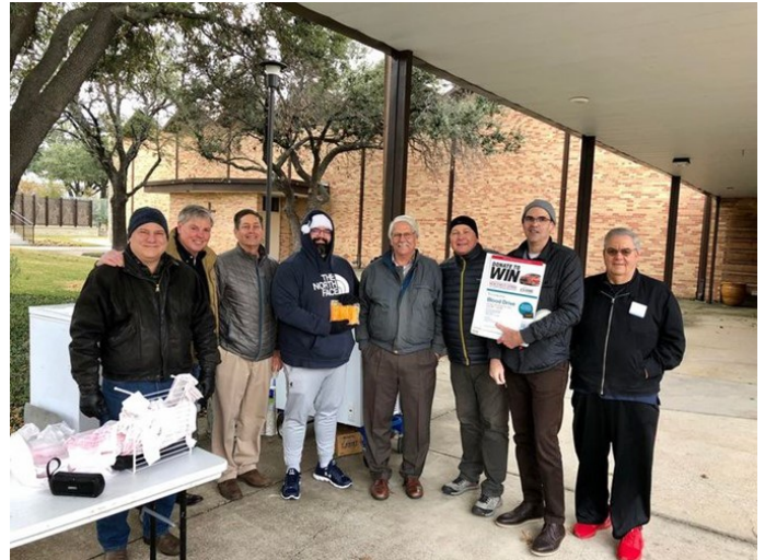
A chilly Sunday morning (December 19 th ) when we did a tamale sale, blood, drive, coffee and donuts, and recruiting