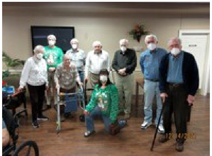
The Nursing Home Bingo Contingent