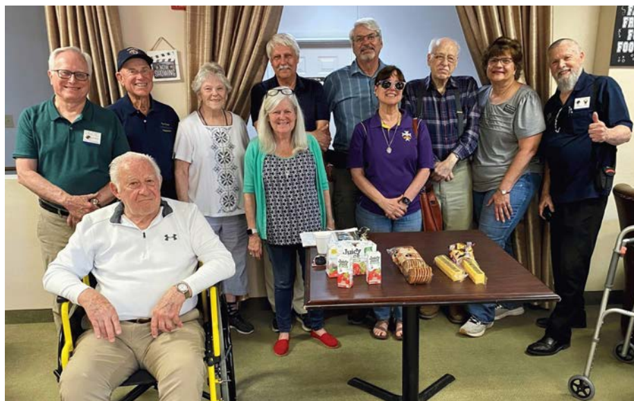
CCHC Bingo: Catholic Daughters and Knights in action, May 20 th